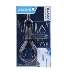
包装 (尺寸 ≤ 300mm)